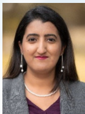
By: Gulbeen Dhillon Training Manager

Dear Students, You are extremely happy to announce that finally, excursion days are back. We are encouraging our current commercial cookery, leadership & management students to attend an excursion. arranged by Fine Food Australia Showcasing the latest innovations in food, beverages, and equipment. If you thirst for an edge this is where you'll hear it first. Food industry leaders and successful operators deliver practical solutions to challenging business issues ranging from staffing to profitability. Insights into the changing consumer demands affecting Australia's food industry trends are also sure to stir your thinking. Details of the venue and timing are listed below.