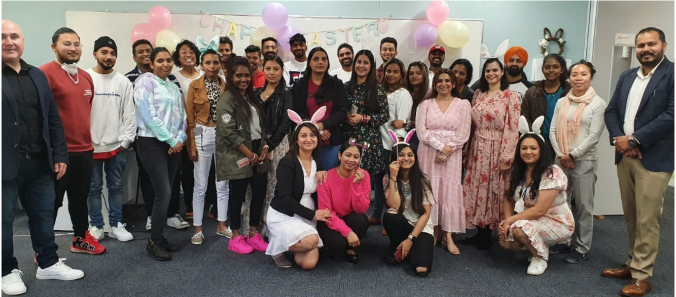
Some of ASLI family members