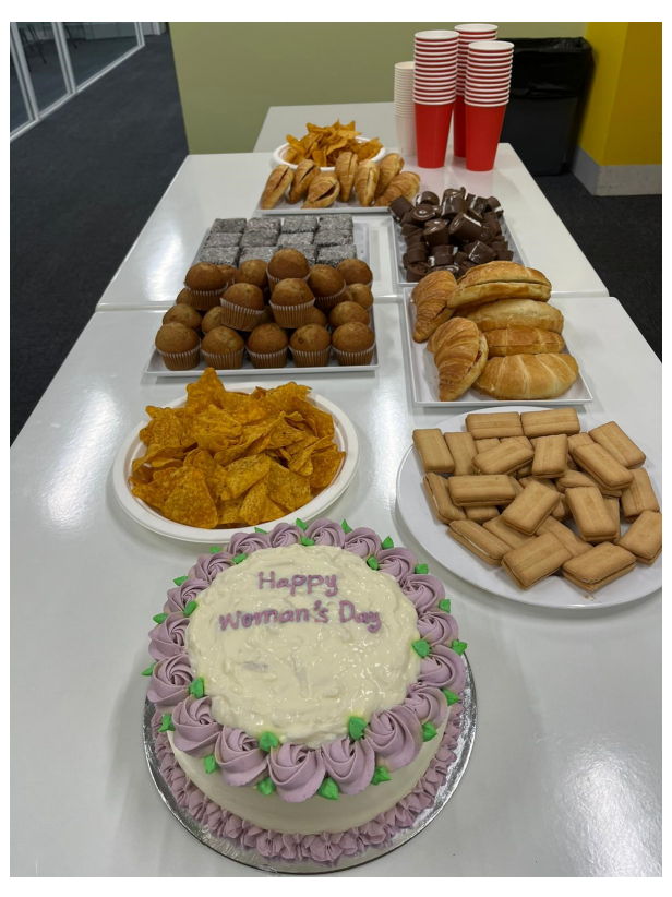
Holi At ASLI: We celebrate a variety of festivals in order to preserve traditions and culture. We recently celebrated Holi, "the festival of colours," at ASLI on Wednesday, March 8, 2023, with lots of fun and delicious food. ASLI is a cultural melting pot; participating in the Holi celebration encouraged everyone to blend in even more.

We are looking forward to celebrating more cultural occasions.